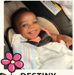
DESTINY 4 Months